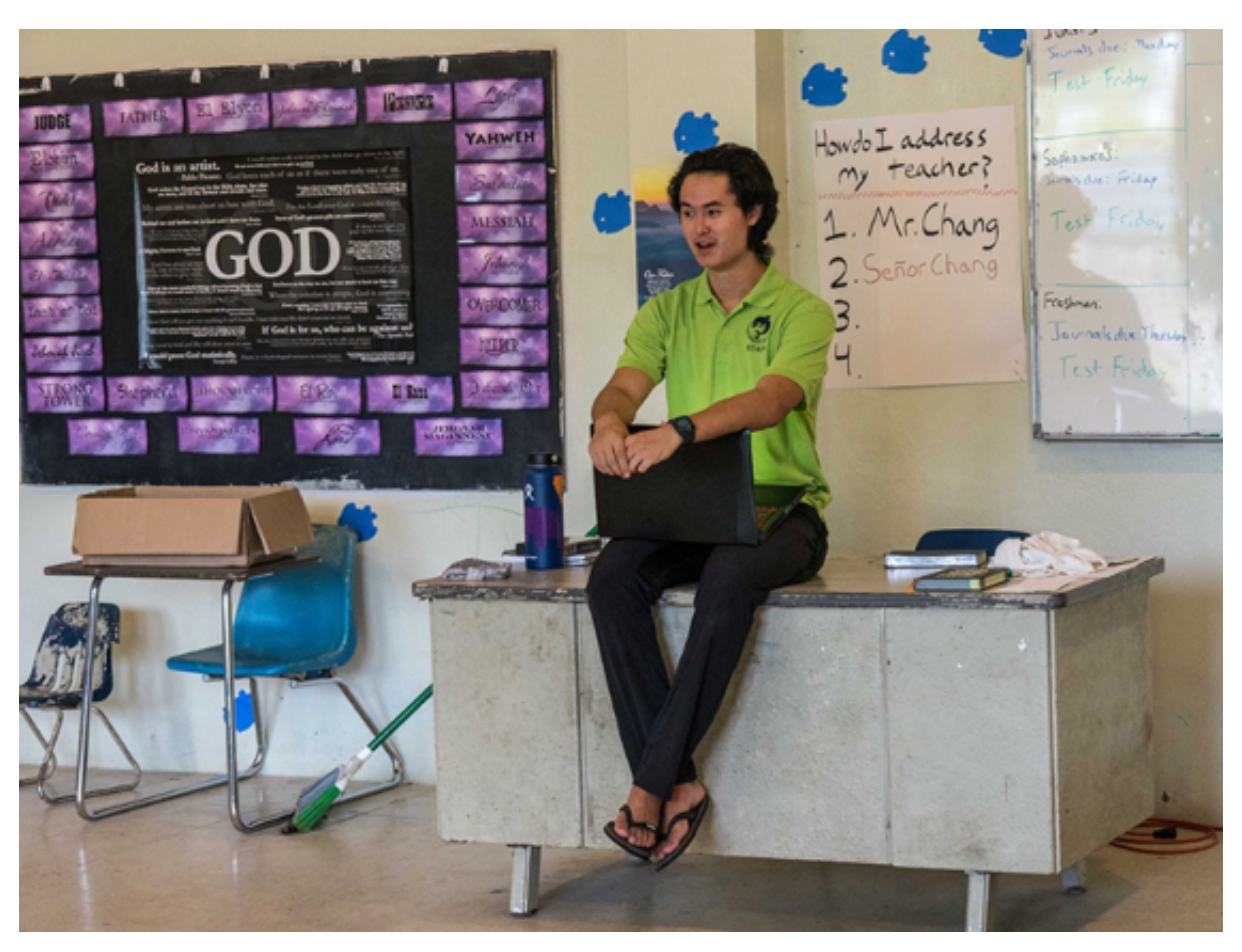
You're Not Alone