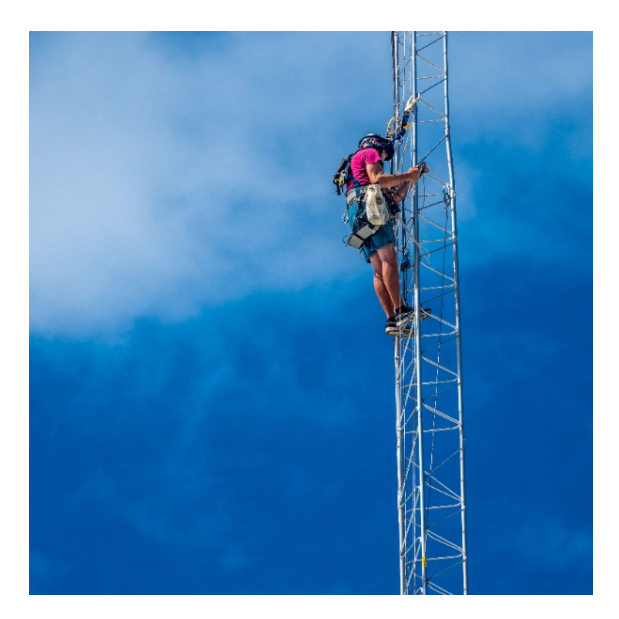
Majuro, Marshall Islands, has a new station to listen to as Joy 90.7 FM began its first broadcast on Jan. 12. Between two towering radio antennas, one located in the city of Majuro and another in the village of Laura, almost 28,000 will be able to enjoy daily Adventist programming. MORE

"Some today are questioning the presence of those [in the United States] who come from countries currently facing political, economic, and natural disaster challenges. As the most ethnically-diverse Christian denomination in the U.S., the Seventh-day Adventist Church proudly defends the rights of all men, women and children, no matter their country of origin." READ MORE of this NAD statement.